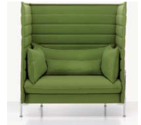
Alcove Highback Love Seat

The fact that the Alcove Highback Sofas offer protection from both acoustic and visual stimuli makes them a welcome addition to any open-plan office environment. They are perfect to retreat to and for holding meetings.