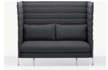
Alcove Highback Two-Seater

The Alcove Highback System allows for both shape and size configurations that meet the demands of any given space.