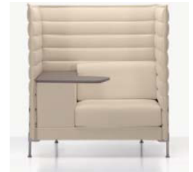
Alcove Highback Work